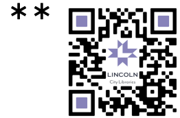
Online Events Calendar