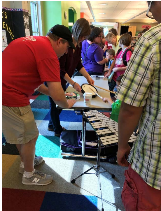
Lincoln Symphony Orchestra Family Storytime